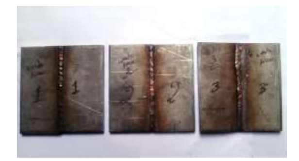
Fig. 1.2 Welded Samples 304 Stainless Steel

Stainless steel is actually a generic referring to a family of over two dozen grade of commonly used alloys. Essentially it is an alloy having of 10.5 percent chromium. In this experimental work, 316 Stainless Steel is used as a work piece. Stainless steel, grade 316 is a versatile "low carbon (0.08%) - Chromium-Nickel steel suitable for a wide variety of welding application. Photographic view of welded sample is shown below.